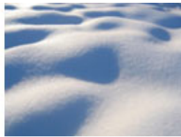
Cold -4°F/-20°C MIL-STD-810F