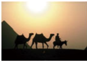
Heat +140°F/+60°C MIL-STD-810F