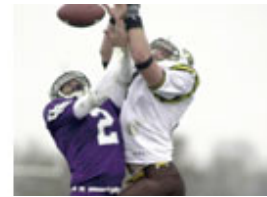
Shock 3ft drop to concrete